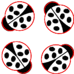
Ladybug 30mm Sorted.pes 73.70x74.60 mm; 5,062 stitches 3 thread changes; 3 colors