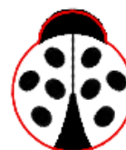
Ladybug 40mm.pes 40.00x47.20 mm; 1,859 stitches 3 thread changes; 3 colors